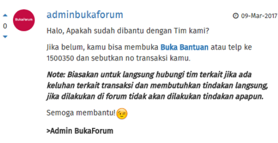
FIGURE 3 COMMENT FROM ADMIN TO SUGGEST USER FOR CONTACTING BUKA BANTUAN

give a comment so that the post creator immediately contacts BukaBantuan. Comments from the Bukalapak admin can be seen in Figure 2. Form this case, it can be seen that the community already has some policies regarding the operation in the community forum. When the policy was violated, then the admin would remind the member and give suggestion.