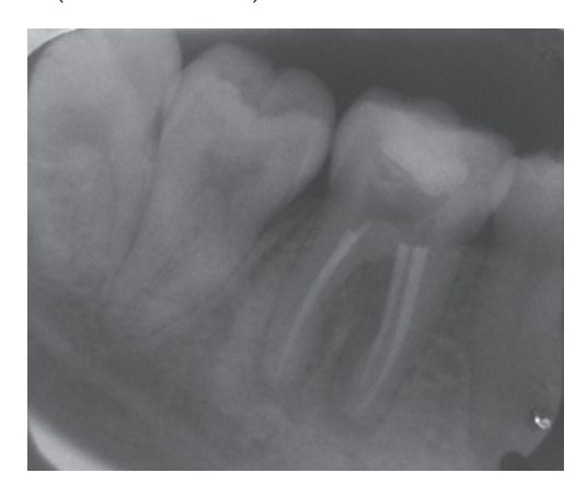
Figure 4. Radiographic illustration of hermetic filling

Root canals were irrigated again using the liquids of NaOCL 2,5%, EDTA 17%, and Clorhexidine 2%. All root canals were dried with paper point. Gutta percha point was sterilized and soaked in the liquid of NaOCl 2,5% for 1 minute, rinsed with alcohol 70% and dried. Obturation with single cone technique was choosen. First, a lentulo which was already smeared with pasta sealer (Topseal, Dentsply) was inserted and spinned with into the root canal and one third of the apical guta perca was smeared with sealer and inserted into the root canal. The obturation was done in the root canal one by one. The rest of the gutta percha was cut using endodontic plugger which had been heated as long as the orifice and condensed with light press. The result of the root canal filling was confirmed by radiography. The result of the obturation showed hermetic filling (Figure 4). The bottom of the cavity was closed by glass ionomer cement and temporarily restorated with cavit (Cavitron, GC).