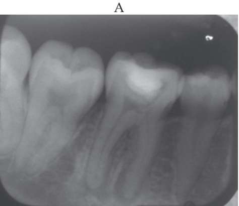
B Figure 1 A. Gumboil on the buccal mucosa of tooth 46; B. Radiolucent in the bifurcation and periapical of tooth 46

Japan). The caries tissues were cleaned by using metal bur and excavator. Opening access was done with endoacces bur (Dentsply) up to the depth of the pulp chamber reaching the orifice. Then, it was continued by using diamendo (Dentsply) to make wider entry access to the orifice. Irrigation was done with 2.5 ml of NaOCl 2.5% in the cavity and orifice which had been opened (mesiobuccal, mesiolingual, and distal).