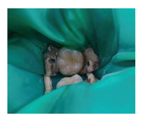
C Figure 6 A. The application of short fiber reinforced composite; B and C. The applications of cusp-bycusp packable composite resin

After the rubber dam was removed, occlusal checking was done with articulating paper. The traumatic part was reduced with a yellow-band pear shaped finishing bur. The