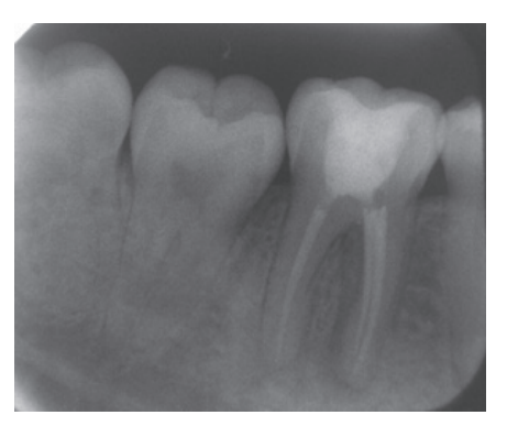
B Figure 7. A. Clinical illustration of finishing and polishing tooth; B. Radiographic illustration of restorated tooth

On the fourth visit, the check-up for the restoration was done clinically and radiographically. The patient did not have any complaints and felt satisfied and comfortable with the tooth restoration. In the objective examination, it seemed that the adaptation of the composite resin restoration was good, the contour was good, there was no traumatic occlusion, there was no discoloration of the restoration, the health of the tooth supporting tissues was good, and there was no gingival inflammation. Percussion and palpation tests also showed negative results. In radiographic examination, radiolucent in the bi-