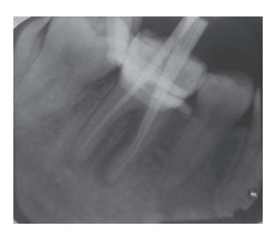
B Figure 3 A. The fitting of guta perca; B. The fitting of gutaperca by radiography

Root canals were irrigated again using the liquids of NaOCL 2,5%, EDTA 17%, and Clorhexidine 2%. All root canals were dried with paper point. Gutta percha point was sterilized and soaked in the liquid of NaOCl 2,5% for 1 minute, rinsed with alcohol 70% and dried. Obturation with single cone technique was choosen. First, a lentulo which was already smeared with pasta sealer (Topseal, Dentsply) was inserted and spinned with into the root canal and one third of the apical guta perca was smeared with sealer and inserted into the root canal. The obturation was done in the root canal one by one. The rest of the gutta percha was cut using endodontic plugger which had been heated as long as the orifice and condensed with light press. The result of the root canal filling was confirmed by radiography. The result of the obturation showed hermetic filling (Figure 4). The bottom of the cavity was closed by glass ionomer cement and temporarily restorated with cavit (Cavitron, GC).