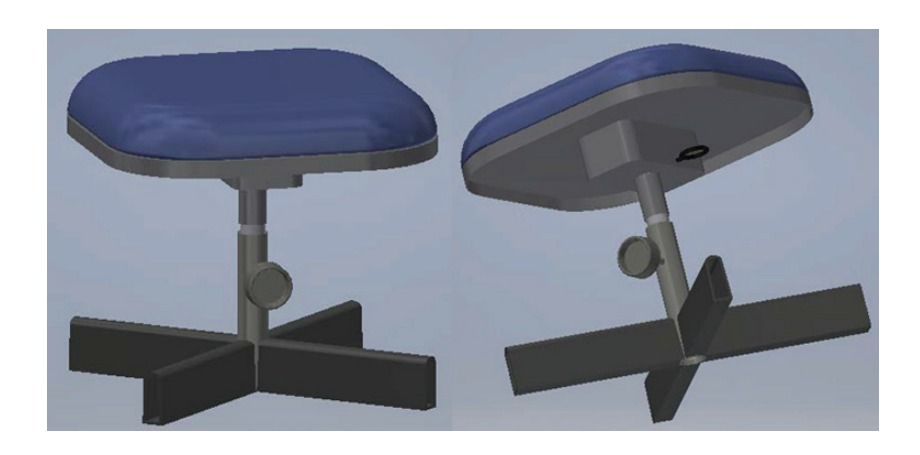
Figure 2. The 3D Model of the Adjustable-Ergonomic Chair