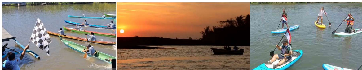
Figure 6. Marine tourism attractions and views of Perancak Beach.

menu of sea and freshwater fish as well as processed foods typical of the port coastal area.