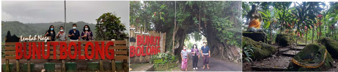
Figure 2. Dragon Valey, Bunut hole tree, Sarcopagus.

The tourist village offers a range of attractions, activities, and community-based businesses for visitors to enjoy. These include taking selfies at Bunut Bolong (as seen on Figure 2 ), exploring the archaeological sites of Batu Palungan and Sarcopagus, witnessing the twin waterfalls, embarking on forest tracking and Naga Valley exploration, savoring coffee amidst the misty ambiance of Dragon Valley, visiting a cattle farm, learning Balinese dance and gamelan, and indulging in traditional Balinese cuisine.