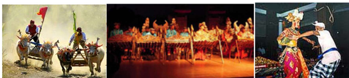
Figure 7. Makepung tradition, jegog and joged bungbung performance.

This village is in close proximity to the coastal region. An interview conducted in 2022 with Mr. Nano highlights the exceptional potential of this village, characterized by a wide range of professions among its residents. These include fishermen, buffalo breeders, producers of organic fertilizer, micro, small, and medium enterprises (MSMEs) engaged in fish product manufacturing, and those involved in the processing of lobsters. Some of these activities can be seen on Figure 7 . This village is renowned for its artistic contributions, particularly in the fields of rindik and joged. By structuring it as a comprehensive tour package, visitors to this village will be thoroughly pleased with the array of activities and attractions available to them. The activities include dance lessons, rindik performances, spectating cow races on the beach, fishing excursions, visits to buffalo farms, and concluding with culinary tours featuring traditional menus consisting of fish, chicken, and various meats. This tourist village is made instagrammable by its camping grounds featuring swings and appealing coral selfie spots. The existence of diverse associations, such as sekehe rindik, mancagra associations, jogging clubs, dance studios, and other artistic organizations, significantly enhances the appeal of this village for tourists.