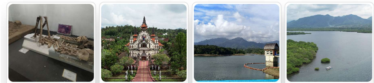
Figure 3. Gilimanuk Museum, Ekasari Church, Palasari Dam and Gilimanuk Bay.

Anom, the manager of this tourist village, stated that the village is situated in close proximity to the dam and boasts expansive brown fields. These varying circumstances result in disparities when it comes to determining the activities and attractions provided to tourists. The tourist village offers a range of activities, such as renting boats at Palasari Dam, visiting selfie spots at Palarejo Village, taking religious tours to the church and Maria Cave, exploring cocoa plantations, learning to dance, and savoring traditional Balinese culinary delights, including satay and suckling pig. Figure 3 shows a couple of these places of interests such as the musem, church, dam, and bay.